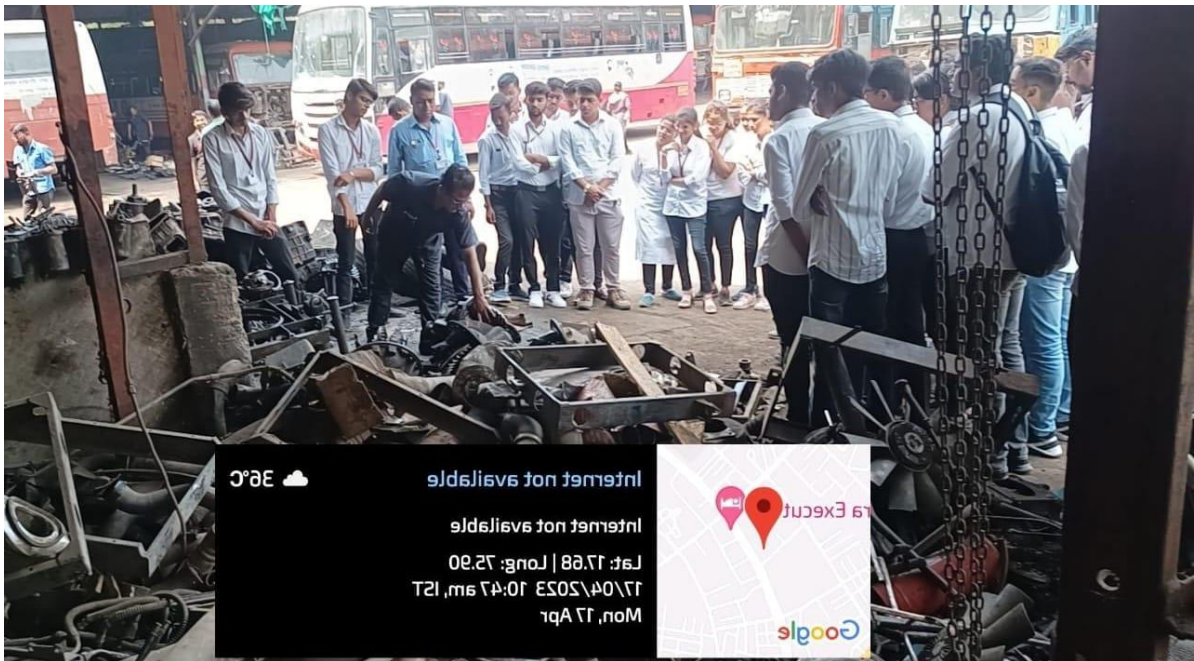
Discussion with S T Workshops Experts