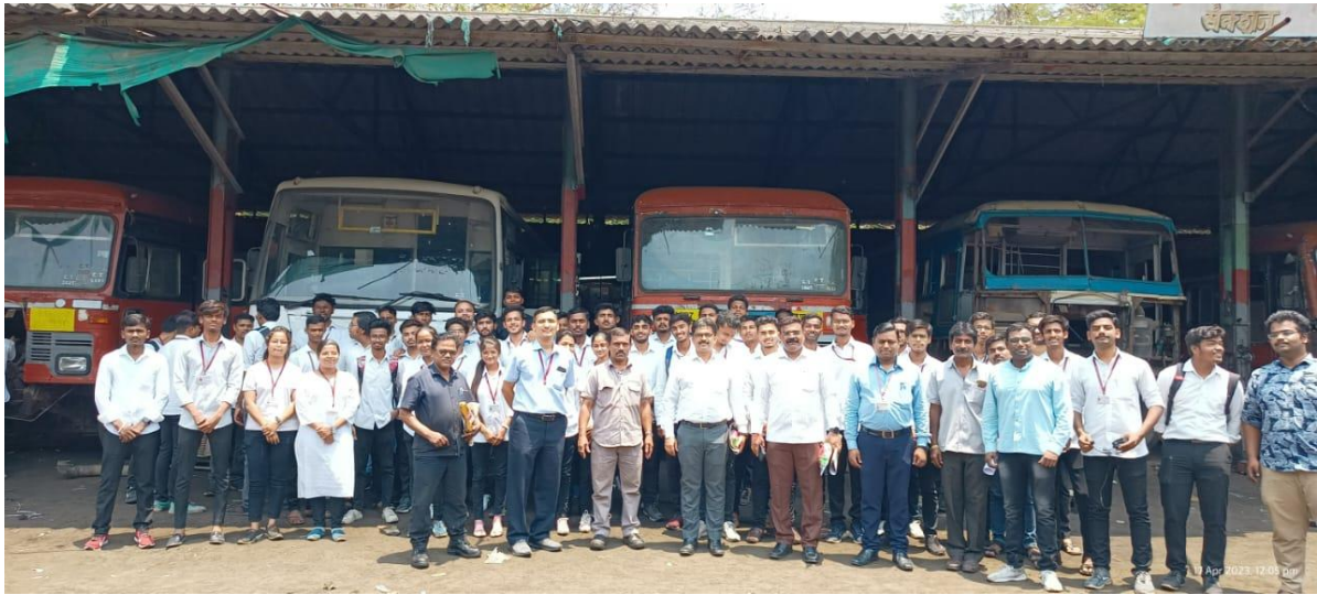
Group photo in front of S T workshop Solapur